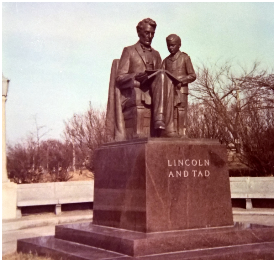
Lincoln and Tad statue Feb.4