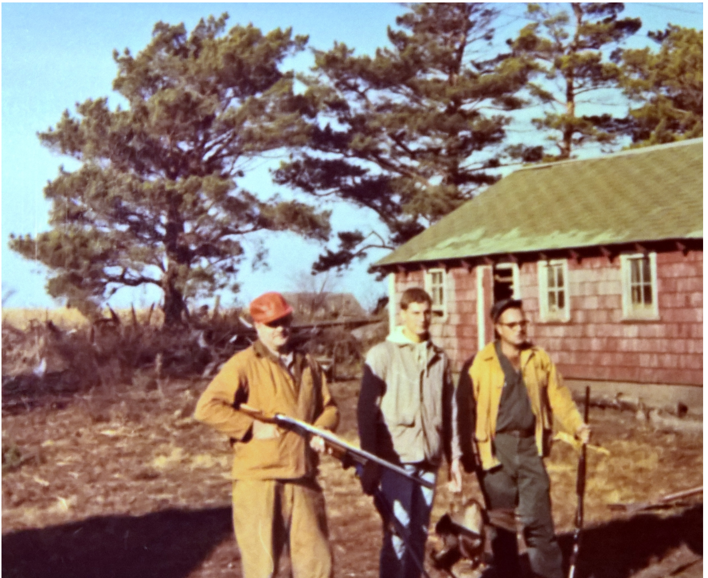
Pheasant hunting, Nov. 1. Dad got 2, Doug 3. Dad also got a rabbit. I shot twice in vain.