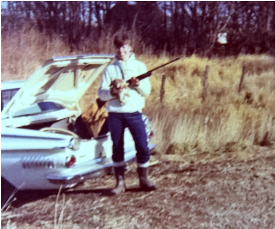
I did not shoot the rabbit