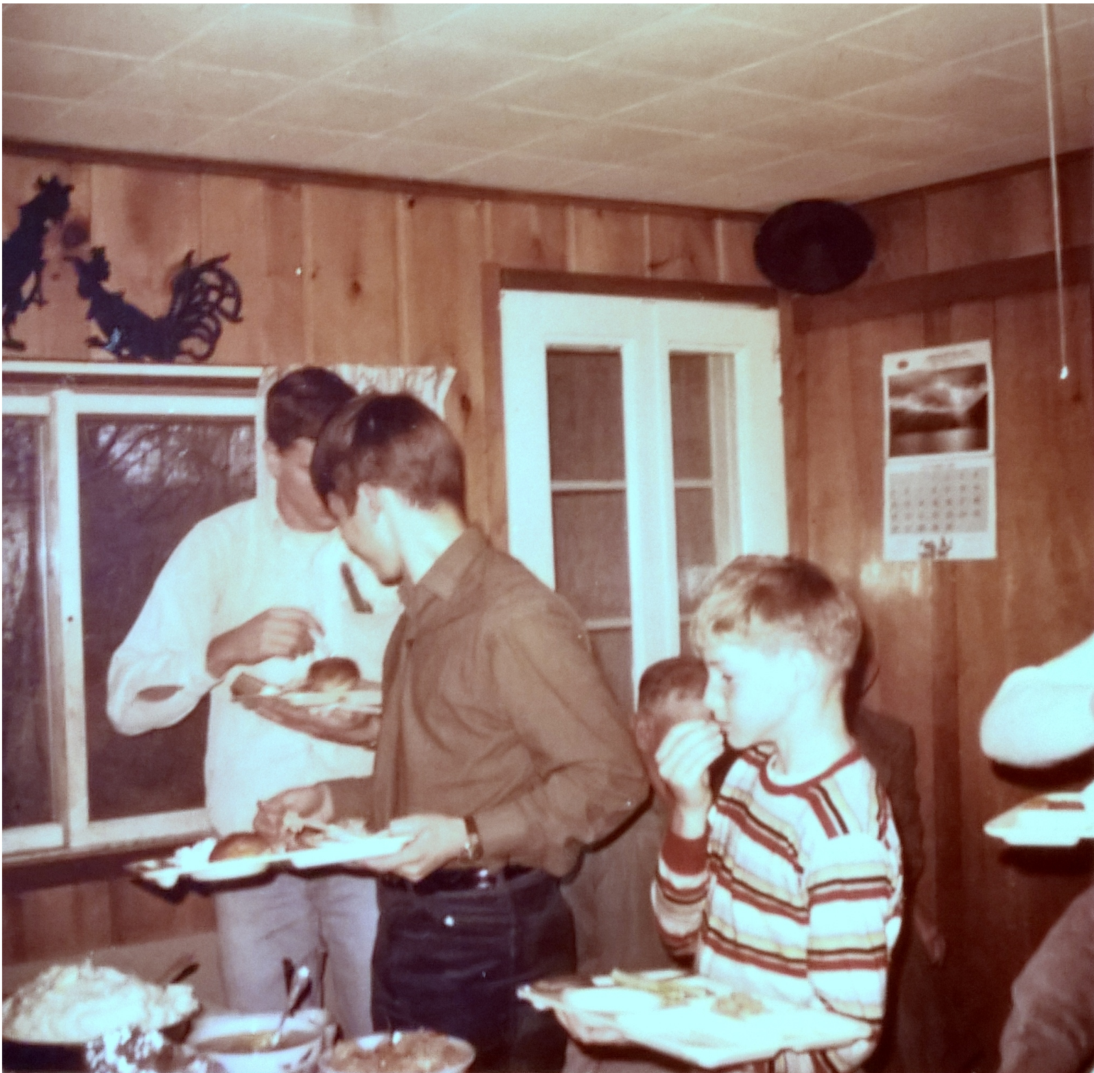
Thanksgiving, Nov. 23 at uncle's in Geneva

"Thanksgiving Day is an annual national holiday in the United States and Canada celebrating the harvest and other blessings of the past year. In the US Thanksgiving is celebrated on the fourth Thursday of November.