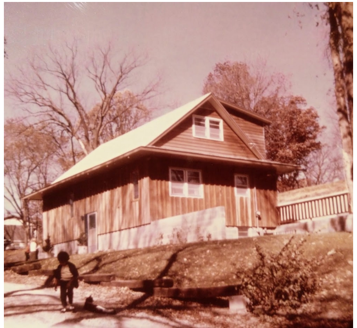
The next day, Oct. 22