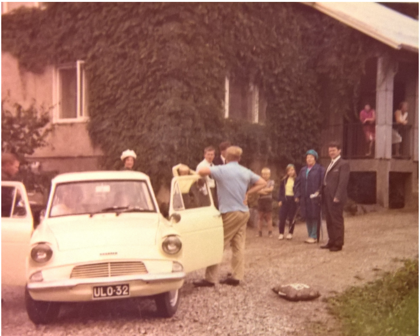
Aug 31 – Sept. 1 we visited my uncle in Kilo, Kypäräkuja 10 .