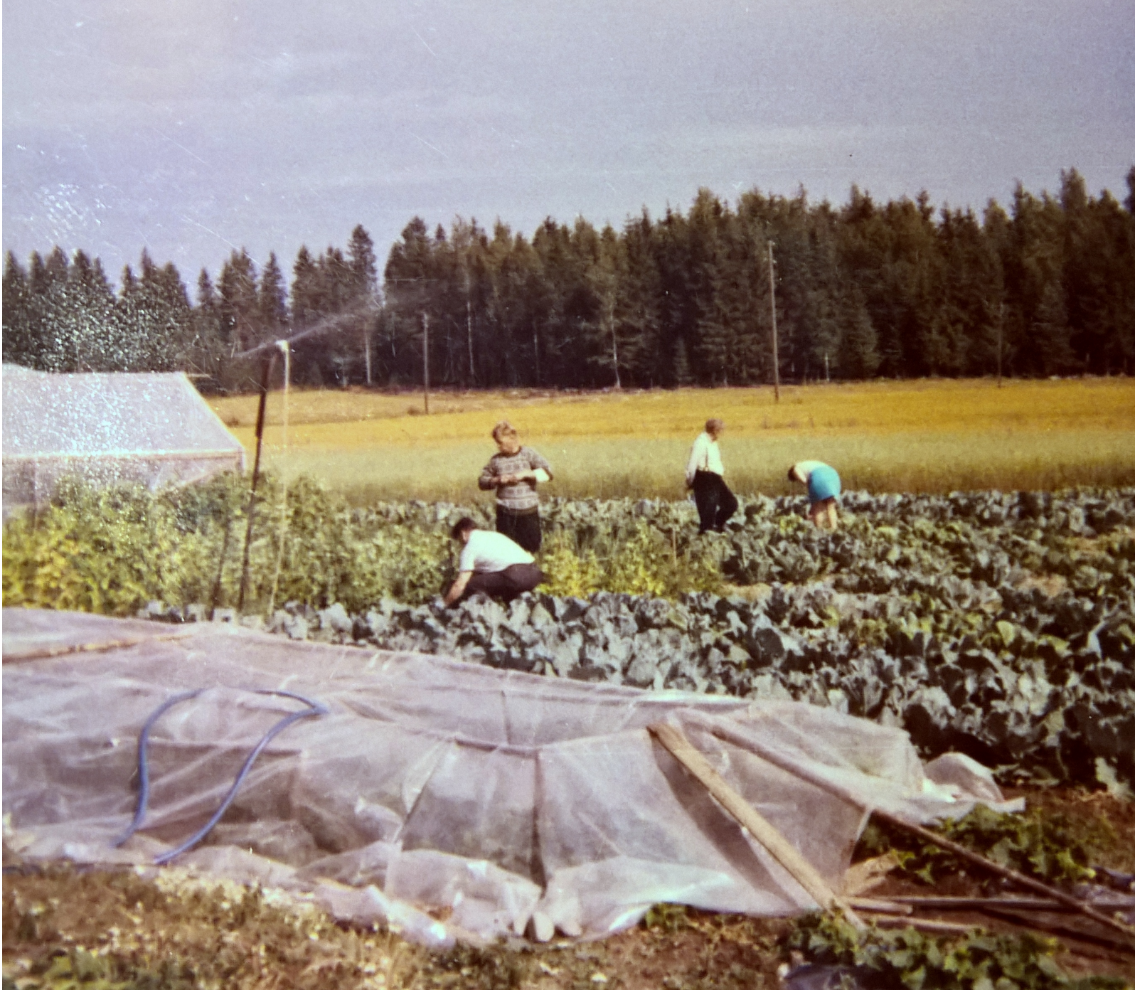
Garden in Mommila, my grandparents home. We visted Mommila on Sunday, Aug. 11. They got the farm after WW II. Farm now