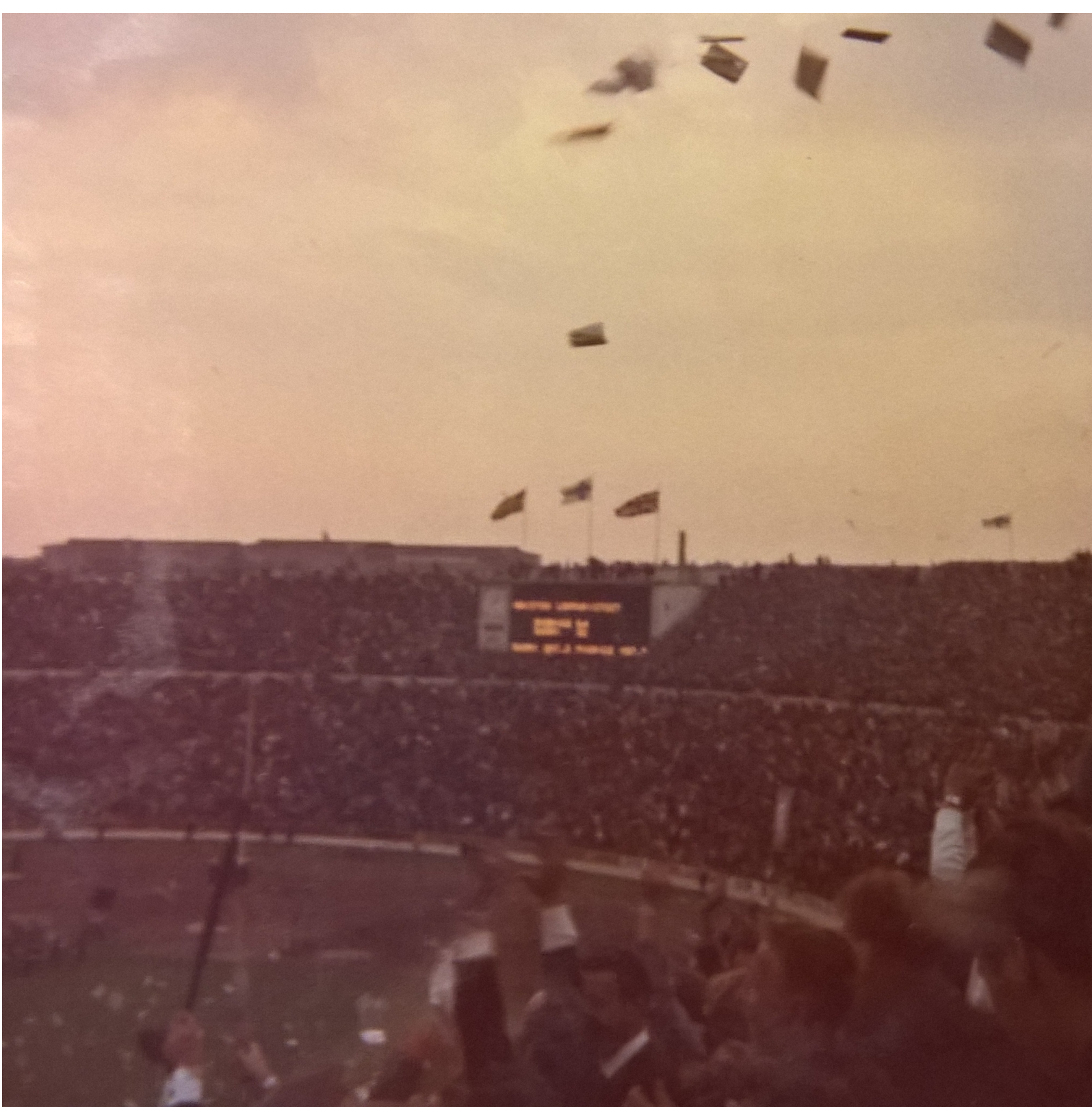
On Sunday we were in athletics meet Sweden- Finland at the 1952 Olympic stadium . Finland won 208.5-199.5.