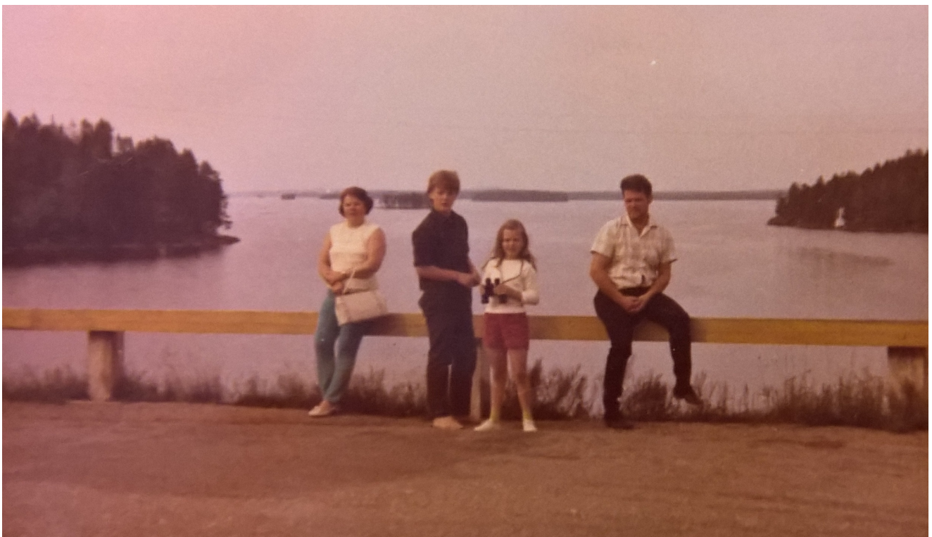
On the way home we stopped here .