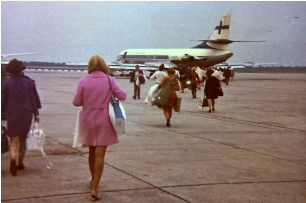
Finnair Super Caravelle landed in Helsinki 10.25 p.m.