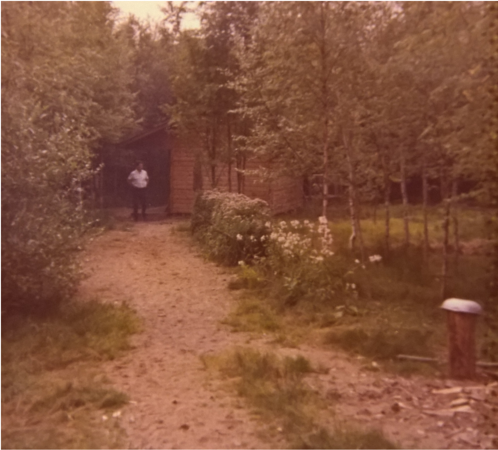
Dad in front of smoke sauna

Aug. 24-25 we visited Rautalampi , my mother's mother