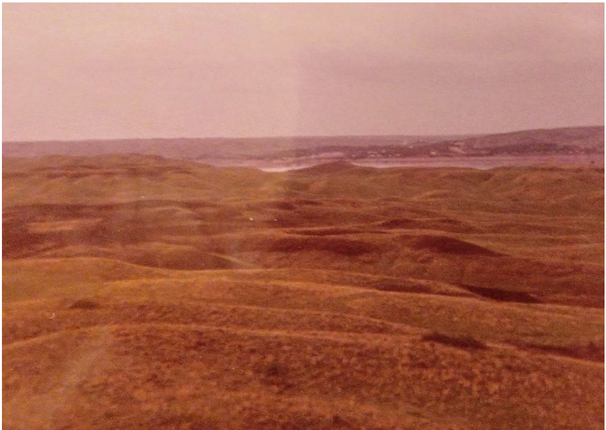
Chamberlain Bridge in the background