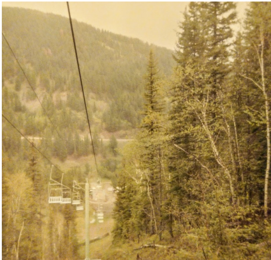
June 10 th at Terry Peak