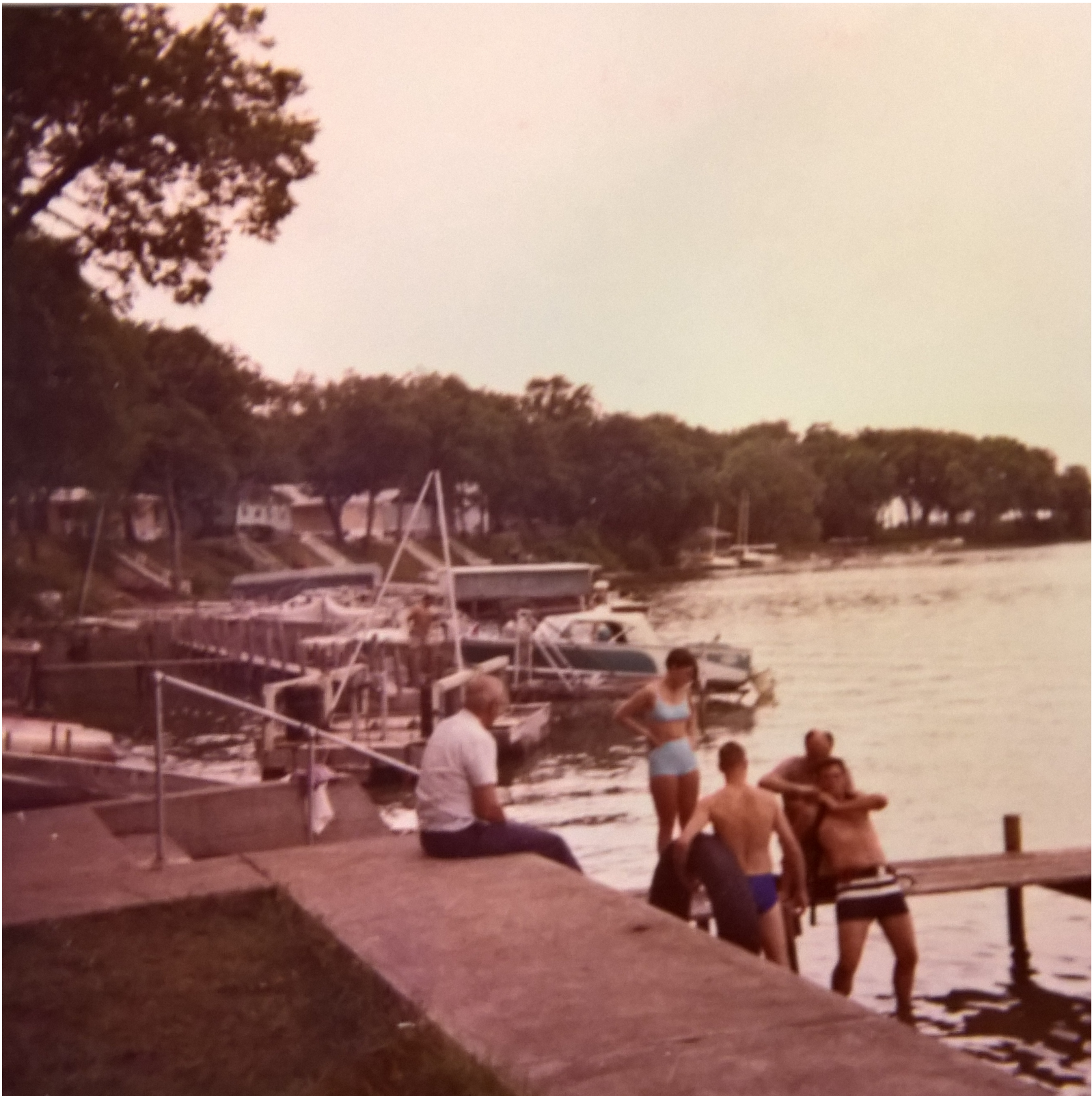
Camping at Clear Lake (?) June 29-30. We water-skied.