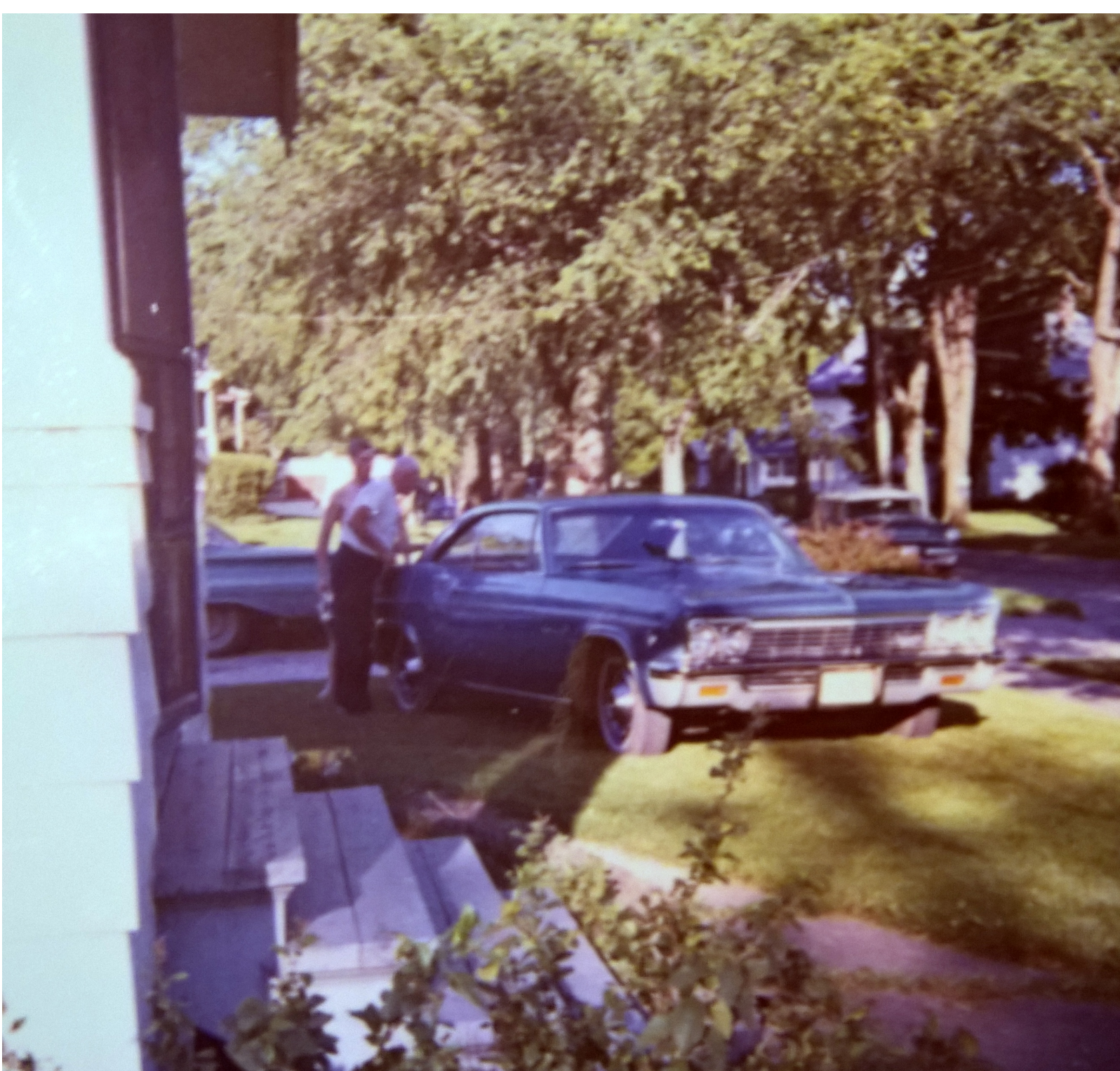
Grandpa's car, I think