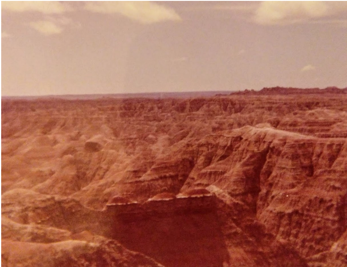
Next day, on the 9 th . The Badlands