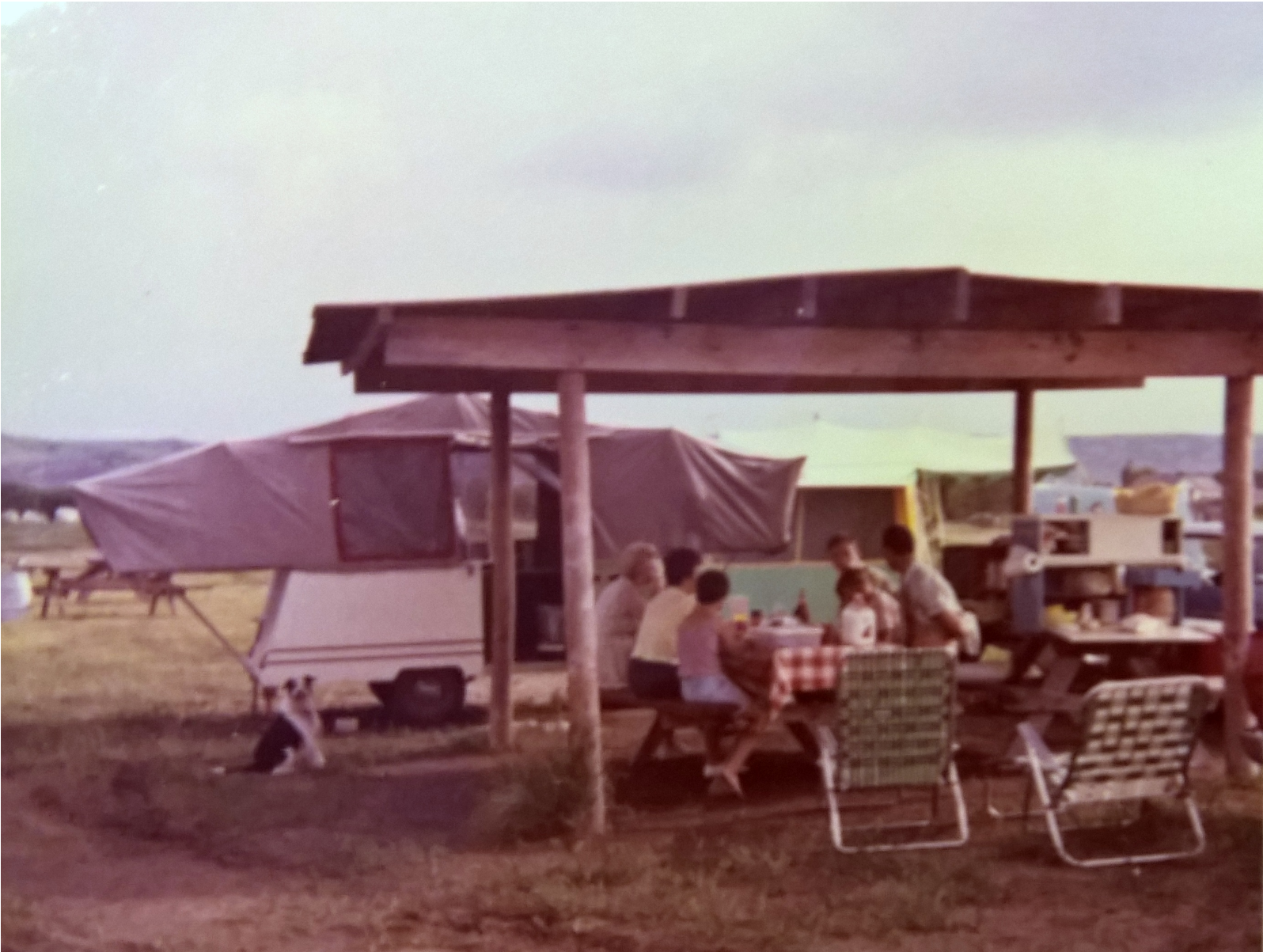
Uncle Earl's travelled with us.

At 3 p.m. we were in Mitchell where we visited The Corn Palace . From there we drove to Chamberlain where we spent the night in our trailer. In the evening Doug and I ran 5 miles, we left 8.45 p.m. On the way back it started to rain but we ran all the way although dad came with a car to pick us up.