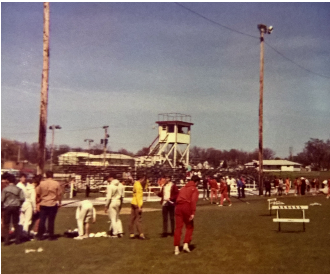
Conference meet, Grundy center , April 30. We won!