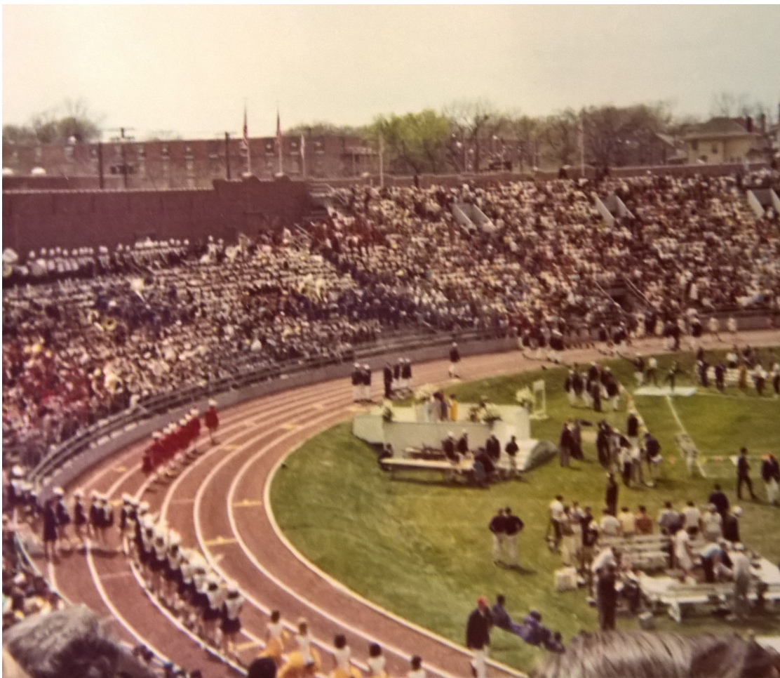
Drake Relay, April 27, Des Moines. Results