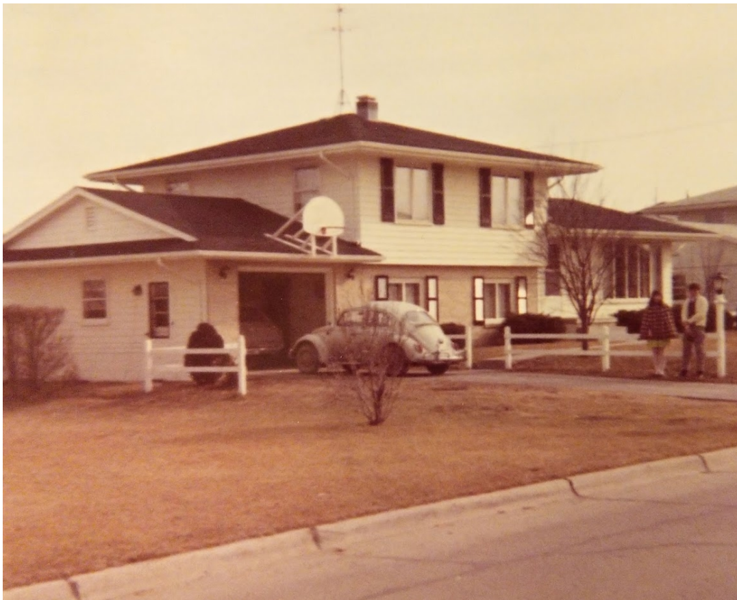
The Peyton house in Urbandale where Ute (from Cedar Falls High) and I stayed overnight